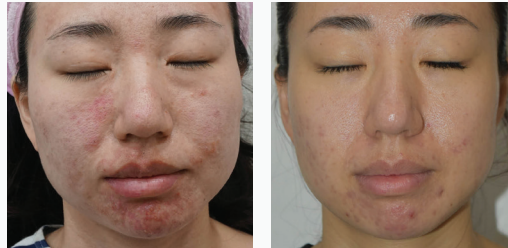
Before and after 3 treatments