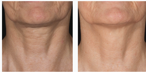
Before & after 1 treatment